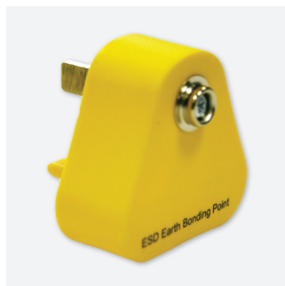
Earth Bonding Plug