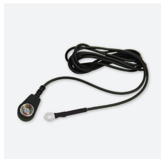
Common Grounding Point Cord - Socket