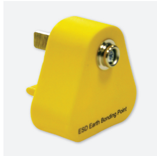
Earth Bonding Plug