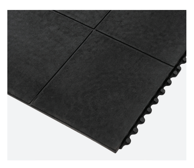
Black only. Bevels available in both black and yellow