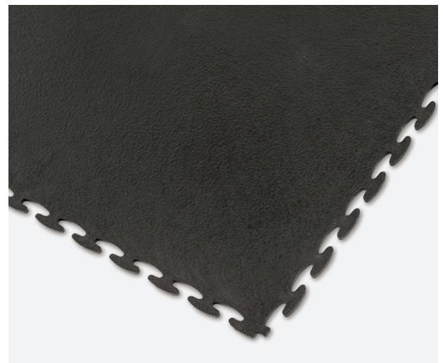
Black in stock, other colours available on request. Bevels available in both black and yellow