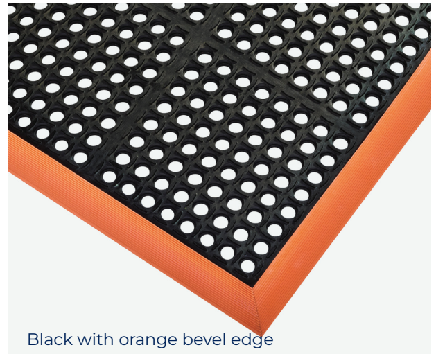
Black with orange bevel edge